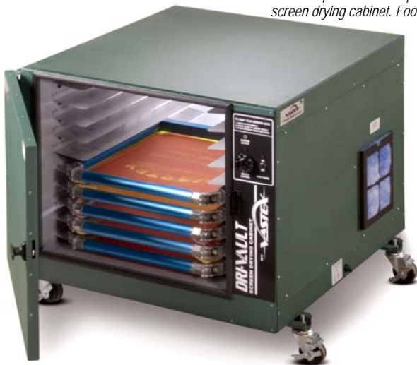
E2331 exposure unit fits perfectly on top of 10 screen drying cabinet. Foot p/n 08-08-018 required